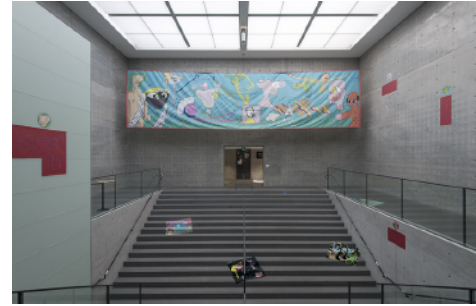
installation view at Painters Now (Hyogo Prefecture Museum of Art/ 2012)