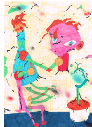
Hiroyuki Nisougi | Nashi (untitled) | 2010 | pen, marker, spray, paper | 297 x 210 mm