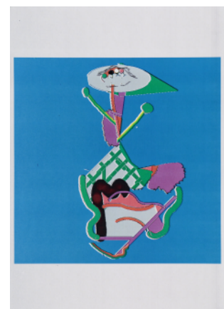
Hiroyuki Nisougi | Nashi (untitled) | 2006 | laser print on paper | 297 x 210 mm