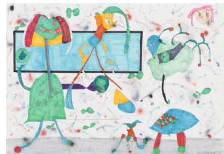
Hiroyuki Nisougi | Nashi (untitled) | 2009 | pen, marker, spray, paper, panel | 515 x 726 mm