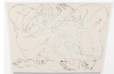
Keisuke Koizumi | Facing Each Other | 2013 | Acrylic color, medium, wood, varnish | 1798 x 1422 mm

2009 "Truth –Art in the Poor Age–" hiromiyoshii (Tokyo)