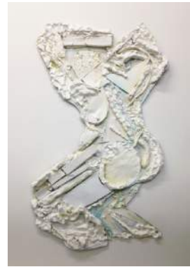
Keisuke Koizumi | Kneeling Down | 2015 | Paper Clay, water color, medium, Paper | 837x502 mm

2007 "my jazz" Musashino Art University (Tokyo)