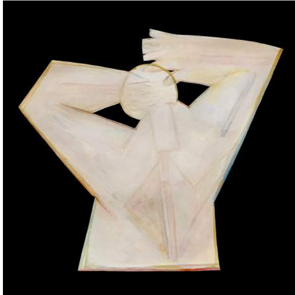
Keisuke Koizumi | Bowl | 2015 | Watercolor, pencil, paper | 144 x 160 mm