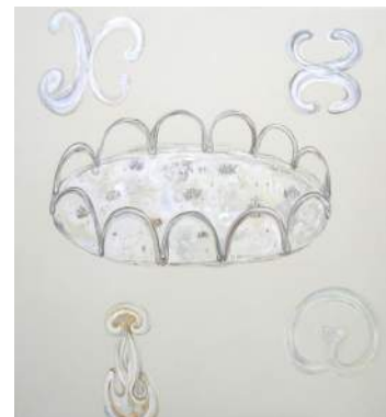
Keisuke Koizumi | asunaro | 2007 | Acrylic on canvas | 1200 x 1000 mm