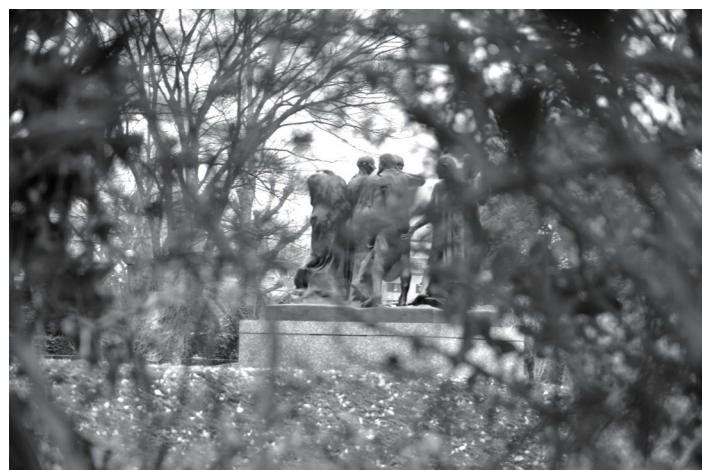
[Top] Takuma Ishikawa | Documentary/Film | 2016 | C-print | 203 x 488 mm [Bottom] Takuma Ishikawa | 6 seconds of 2028 | 2016 | HD video | 8 min 48 sec