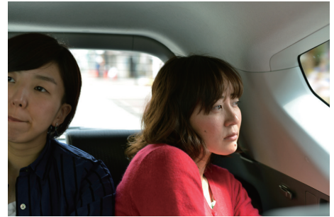
Takuma Ishikawa | Crossing the border | 2015 | HD video, sound | 6 min