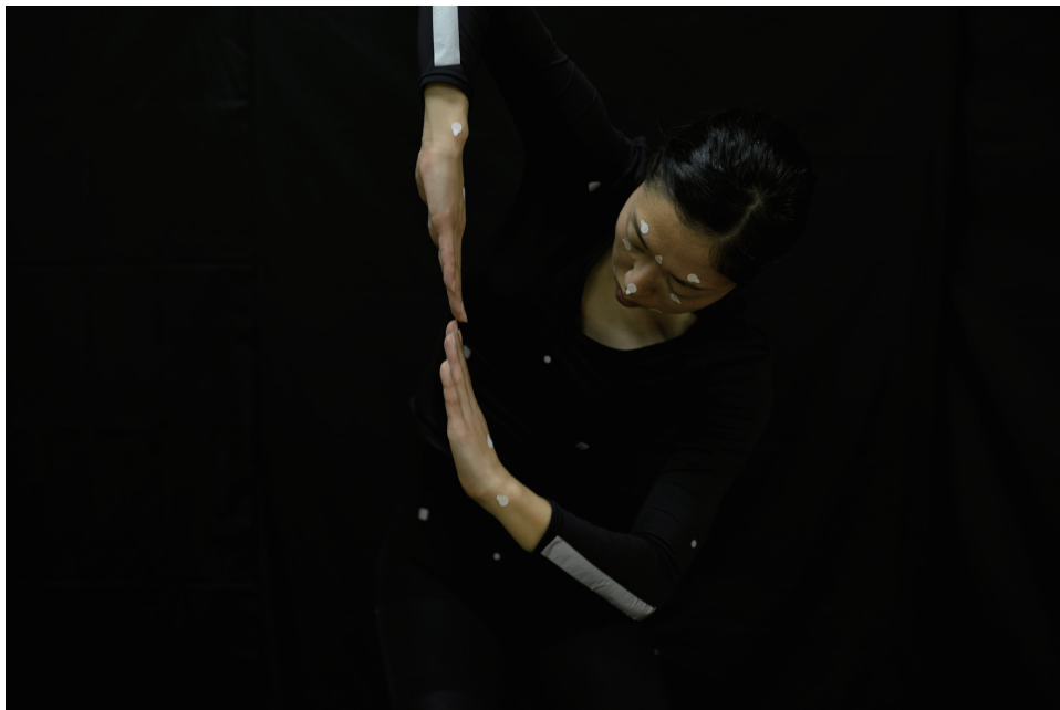
Takuma Ishikawa | Motion/Capture#1 | 2016 | C-print | 27.8 x 41.7 cm

Talion Gallery is pleased to announce the opening of solo exhibition by Takuma Ishikawa for the first time in 2 years.