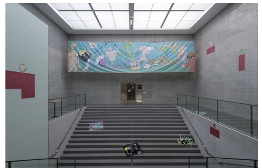
installation view at Painters Now (Hyogo Prefecture Museum of Art/ 2012)