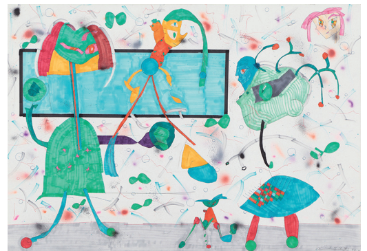
Hiroyuki Nisougi | Nashi (untitled) | 2009 | pen, marker, spray, paper, panel | 515 x 726 mm