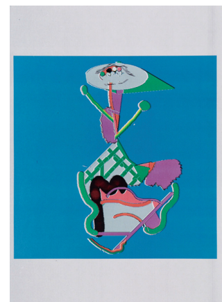
Hiroyuki Nisougi | Nashi (untitled) | 2006 | laser print on paper | 297 x 210 mm