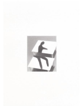
Miyashita Sayuri | Table as Stage no. 24 | 2014 | pencil on paper | 366 x 446 mm