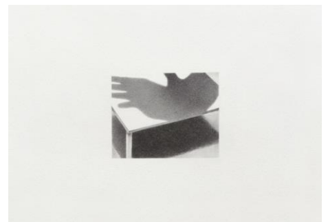
Miyashita Sayuri | Table as Stage no. 17 | 2012 | pencil on paper | 374 x 454 mm (frame size)