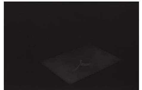
Miyashita Sayuri | Presentation no. 1 | 2013 | Acrylic gouache, pencil on paper | 535 x 426 mm