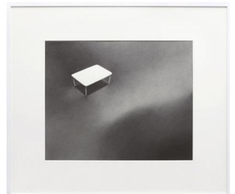
Miyashita Sayuri | Replacer of Light no. 0 | 2011 | pencil on paper | 551 x 631 mm (frame size)