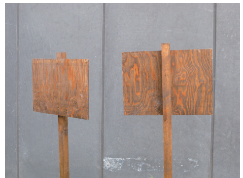
Calling / Old Tricks | 2010 | Chromogenic print | 393 x 492 mm