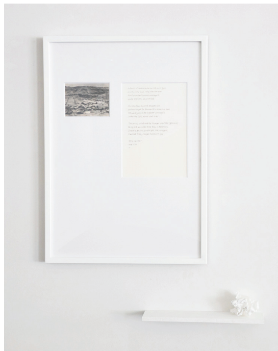
[Left top] Takuma Ishikawa | Kodak Portra 400 Professional 120 Film, p49 (The Throat of Memory) | 2016 | Pencil on paper | 209 x 296 mm