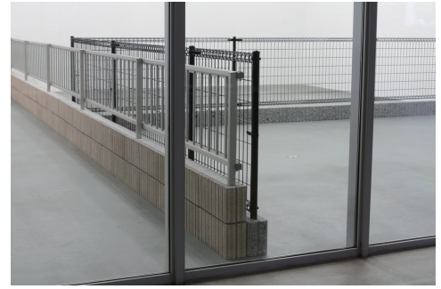
Valley | 2016 | Concrete block, fence | Dimensions variable