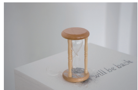
Broken Sandglass | 2013 | Sandglass, glitters | Dimensions variable