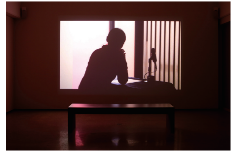
How Many Nights | 2017 | Single channel video, sound 37:00