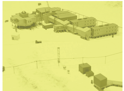
untitled #4 | 2013 | Chromogenic print | 393 x 493 mm