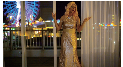
Flower Names | 2015 Single channel video, color, sound | 20:59