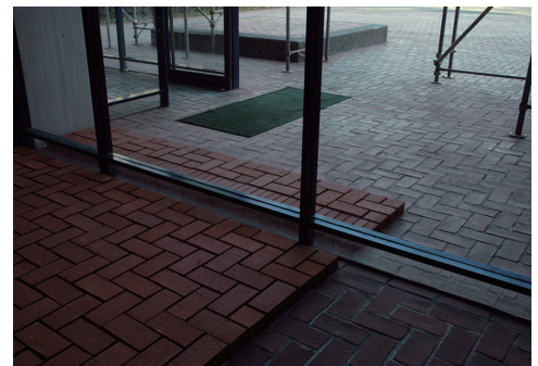
Brick | 2009 | Brick | Dimensions variable