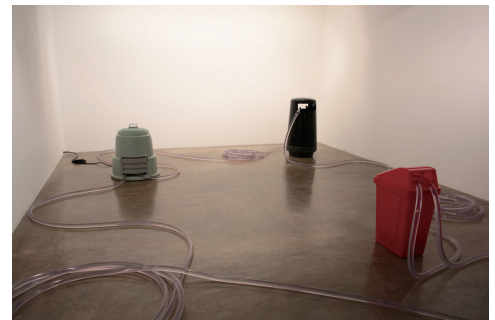
River | 2013 | Litter bin, pump, hosepipe, water, bell | Dimensions variable