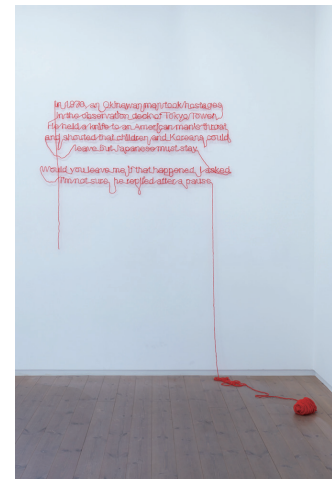
1970 | 2016 | Acrylic yarn, silk pins Diemsnisons variable | Photo: Kenji Takahashi