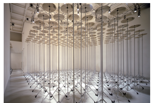
Flooring | 2007 | Cymbal, cymbal stand | Dimensions variable