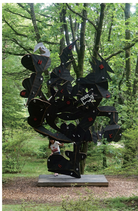
Takuya Yamashita | museum×an (I make a sculpture of the mascot of Atlanta Olympic: IZZY with the outer wall of Nakamura Keith Haring collection as material.)

2013 | The floorboard of an exhibition, black light, fluorescent paint, Japanese paper, silken gut | Dimensions variable