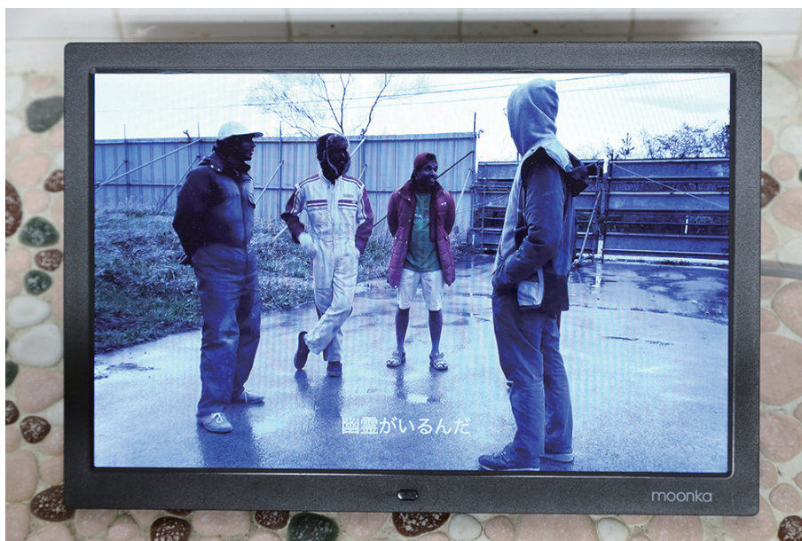
Kazumichi Komatsu | Ghost Racer/ Display' s Ghost | 2019 | Digital Photoframe, video | 5 min 3 sec