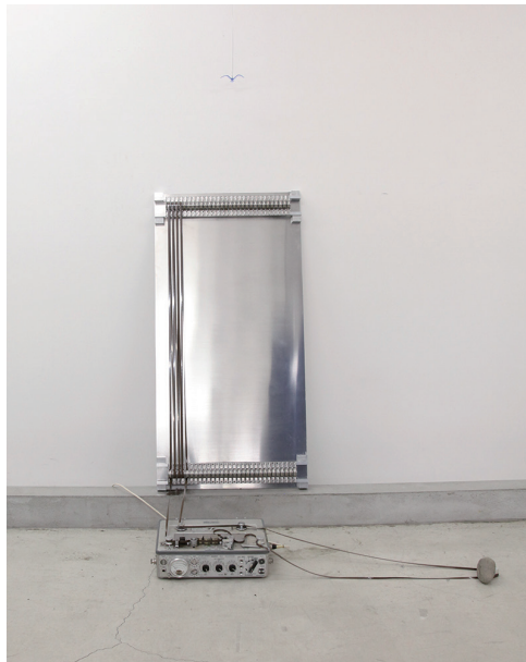
Itsuki Doi | Blues | 2017 | Installation

"Jens I PREVIEW 17SS"(2016 / music). http://cotofu.com