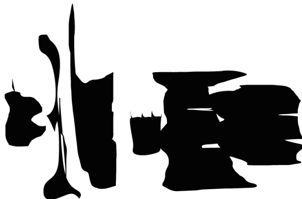
Calligraphy for "Bee Wee"

Under the title of "Bee Wee", two young artists deal and develop innate mechanism of human intelligence eliminating informations and conflicting relationship between image and sign through this show.