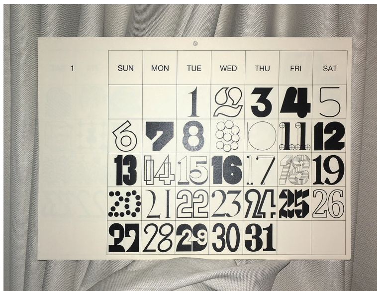
Tezzo Suzuki | Calendar19 | 2019 | Self publishing project since 2013

Recent selected exhibitions include "Typojanchi 2019: 6th International Typography Biennale design festival" Culture Station Seoul 284 (2019/Seoul), "Piercing a rodlike thing" TALION GALLERY (2019/Tokyo), "ILLUMINATING GRAPHICS 2" Creation Gallery G8 (2019/Tokyo), "Mount Fuji Exhibition 1.0" AWAJI Cafe & Gallery (2018/Tokyo) "TRANSBOOKS" book fair/TAM COWORKING TOKYO (2017/Tokyo), "Congress" Earth & Salt (2016/Tokyo), "Exhibition Font Thesis" Галерея Промграфика (2015/Moscow), "Dinosaur Expo" Hotori (2015/Tokyo), "KABK Graduation Festival 2015" Royal Academy of Art The Hague (2015/Hague), "Circle X 2" Roji to hito (2014/Tokyo), "memories" Earth & Salt (2014/Tokyo).