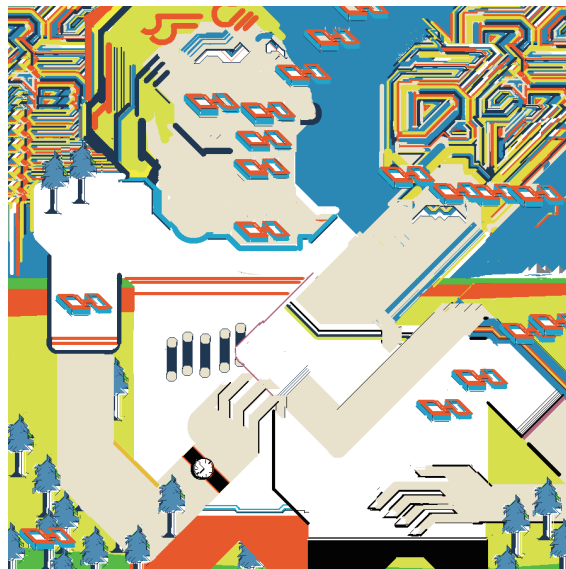
Hiroyuki Nisougi | Nashi | 2005 | Oekaki BBS | 900×900pixel

Recent selected exhibitions include "East Asia Culture City 2019《3^x = ∞ ound Town 》" Incheon Art Platform (2019/Incheon, Korea), "Exhibition inviting gnck to evaluate the works of Hiroyuki Nisougi and Naoki Yamamoto" parplume gallery (2019/Tokyo), "New Works" TALION GALLERY (2018/Tokyo), "Rise up! Rise up, Hideki" bar Hoshio (2017/Tokyo), "DIE Posters" TALION GALLERY (2016/Tokyo), "Nise The Choice" billiken gallery (2015/Tokyo), "Parplume University II" Contemporary Art Museum Kumamoto (2015/Kumamoto), "VOCA The View of Contemporary Art 2014" Ueno Royal Museum (2014/Tokyo), "Illuminated Graphics" creation gallery 8 (2014/Tokyo), "Promise Friends Nearest Neighbor Land Mae" TALION GALLERY (2014/Tokyo), "ii tenki" WILLEM BAARS PROJECTS (2013/Amsterdam), "Der Strum" Nagoya City Gallery Yada (2013/Aichi), "MOBILIS IN MOBILI" Kitakagaya Apartment (2013/Osaka), "A Curator's Message 2012 NEW PHASES in CONTEMPORARY PAINTING" Hyogo Prefectural Museum of Art (2012/Hyogo), "Internet Art Future" ICC (2012/Tokyo).