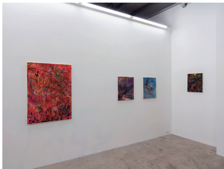
Tadasuke Iwanaga | "summer show" Installation views at Satoko Oe Contemporary | 2016