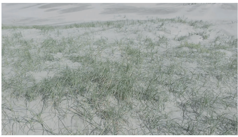
Chong Ri Ae I Island drawing_2 I 2021 I Video I 6min 37sec

Born in Hokkaido, 1991. B.A. Department of Art, Korea University, Tokyo in 2018. Recent main exhibitions include "Bubbles / Debris: Art of the Heisei Period 1989-2019" Kyoto City KYOCERA Museum of Art (2021/Kyoto), "VOCA 2021: The View of Contemporary Art" The Ueno Royal Museum (2021/Tokyo), "Punctum: Feminism in Random Reflections "BONUS TRACK, B&B (2021/Tokyo), "NITO01"~"NITO07" NITO (2020-/Tokyo).