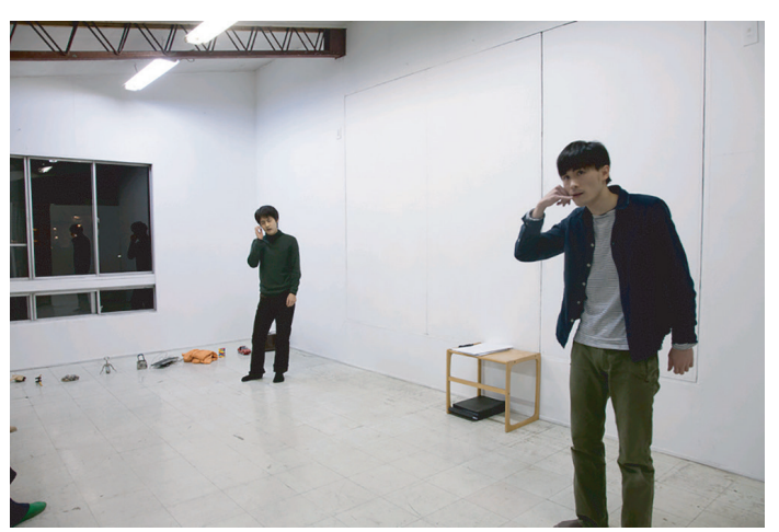
Performance view of "O, 1、2 nine" I 2012

Recent main performances include "FROMCATORI" TALION GALLERY (2020/Tokyo), "井田田回回田田土" blanClass (2019/Kanagawa), "milkyeast pub night II Inn, Tavern, Ale house" milkyeast (2015/Tokyo), "I've Been Dreaming for a Long Time." TALION GALLERY (Tokyo)