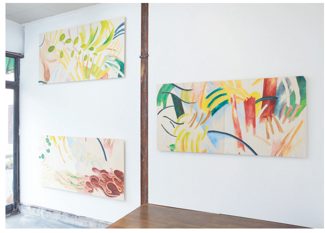
Kaai Tsuji I Chiruchiri I 2018

Recent main solo exhibitions include "Fushimusu-Anamusu" Studio 35 minutes (2019/Tokyo), "Chiruchiri" TABULAE (2018/Tokyo), "The little toe which I hit" Studio 35 minutes (2014/Tokyo), "Pulpy Tentacles" WISH LESS gallery (2014/Tokyo), "Voice from downstairs / Coldness of that floor" waitingroom (Tokyo). Recent main group exhibitions include "Reflection" Art Å~ Jazz M's (2018/Tokyo), "I Say Yesterday, You Hear Tomorrow. Visions from Japan" Gallerie delle Prigioni (2018/Treviso, Italy), "Vampyr, small house watches" TABULAE (2017/Tokyo), "Fools rush in where angels fear to tread."TABULAE (2016/Tokyo).