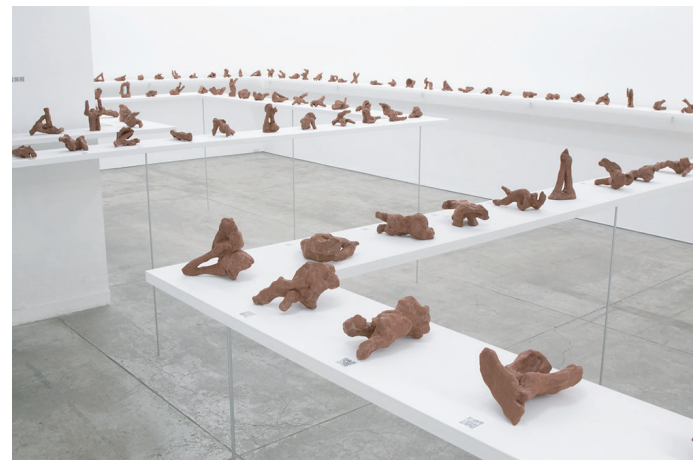
Tatsuo Majima I Dance of the day" I Installation view of "at TARO NASU I 2018

Recent main solo exhibitions include "Dance of the Day" TARO NASU (2018/Tokyo), "Untitled (Live Die Repeat) " TARO NASU (2015/Tokyo), "Léonard Foujita xTatsuo Majima" Tottori Prefectual Museum (2015/Tottori). Recent main group exhibitions include "Mountains and Crowds (Taikan and Leni) / Four Considerations (version TPAM 2019)" blanClass (2019/Kanagawa), "Identity XIV curated by Mizuki Endo - Horizon Effect- nca I nichido contemporary art (2018/Tokyo), "Itoshima Arts Farm 2016" (2016/Fukuoka), "Development" Okayama Art Summit 2016 (2016/Okayama), "PARASOPHIA" Kyoto International Festival of Contemporary Culture (2015/Kyoto).