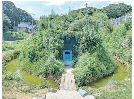
Horajima tumulus | 2019 | Mixed media Installation view at Reborn-Art Festival 2019