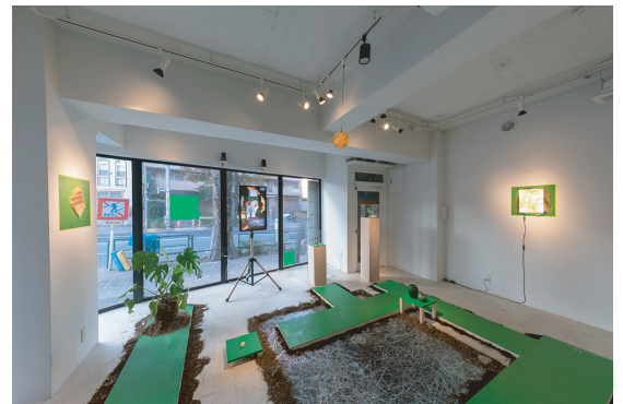
-ATCG | 2018 | Installation view at TAV Gallery