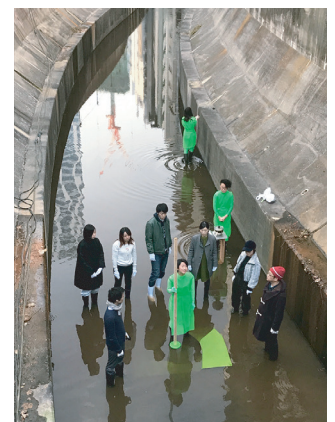
"Fwd:Re: Spring Stream Closing Session" 2017 | Play