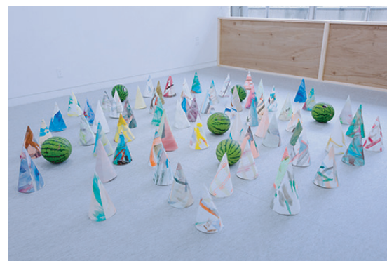
Mymymymymy | 2016 | Acrylic on paper and others | Variable