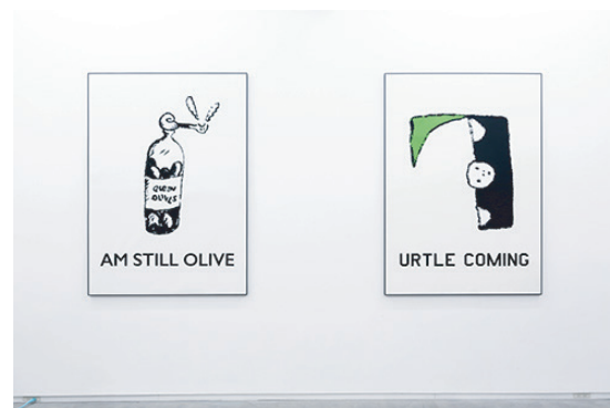
[Left] | AM STILL OLIVE | 2017 | Inkjet on paper | 145.6×103cm [Right] | TURTLE COMING | 2017 | Inkjet on paper | 145.6×103cm