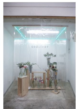
KOMIYA Flower Shop 2016 | Performance