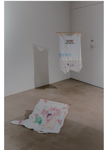
Untitled - Hommage to H.D., J.H. | 2021 Acrylic yarn, cotton thread, felt, silk cloth, silk thread, used clothes | Dimensions variable Cooperated with Nanaka Adachi, Junichiro Endo