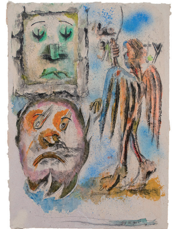
Any number of wishes is acceptable VI | 2022 Acrylic paint, charcoal pencil, sand paste, desert sand, linen, on canvas | 116.7x80.3cm