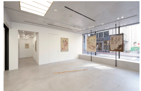
"Catharsis Bed" by 4649 | 2022 | Installation view at CADAN YURAKUCHO