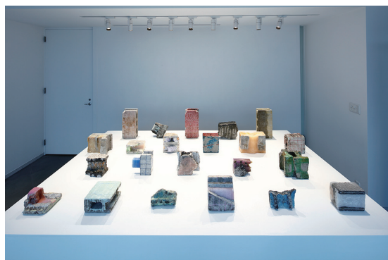
block on wax#1~32 | 2020 | Concrete blocks, paraffin wax, crayon, resin Dimensions variable