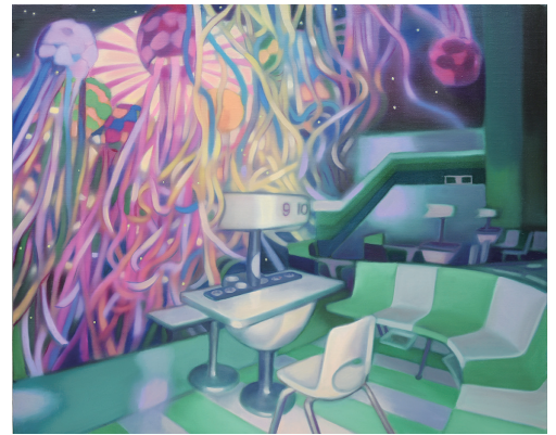
Starlane | 2021 | Oil on canvas | 80.6x100cm

2019 33rd Holbein Scholarship 2018 The 9th Kiyosu City Haruhi Painting Triennale 2016 Musashino Art University Degree Show