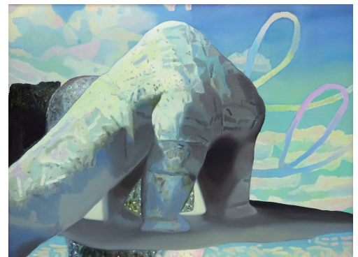
Everywhere else one goes | 2018 | Oil on canvas | 97x130.3cm