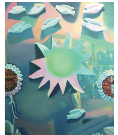
Everywhere else one goes | 2018 Oil on canvas | 91x72.7cm