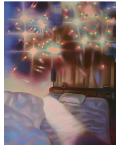
Magic Flight | 2021 | Oil on canvas 116.7x91.3cm