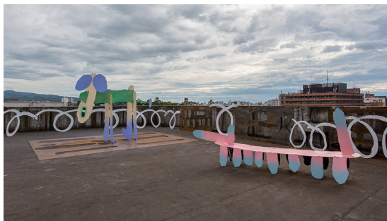
"Say Hello to Strangers" Installation view at Kanazawa city (Ishikawa) 2021