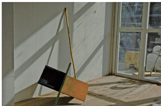
Flying object | 2017 | Wood, lacquer, spray | 58x45x30cm