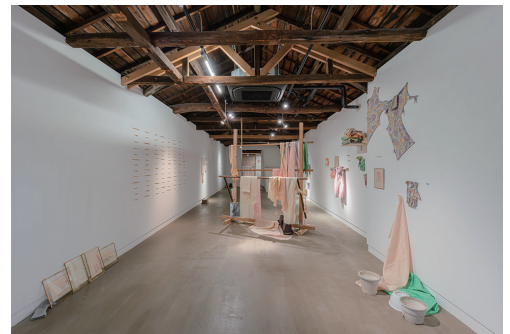
"Circle in red" (2021) Installation view at Komagome SOKO Cooperated with Junichiro Endo