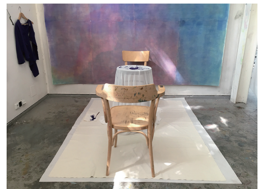
"Let's talk about mother and father." (Part of the process) | 2018 Mixed media Installation, dimensions variable, performance