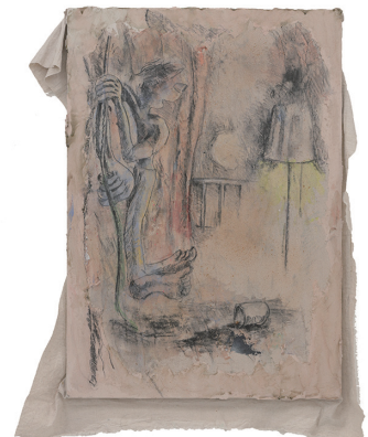
Mansion of hapiness | 2021 Acrylic paint, charcoal pencil, sand paste, desert sand on panel | 85x60cm