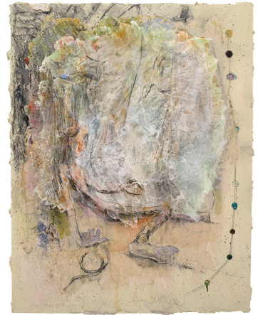
Labyrinths, threads, birds. | 2022 | Acrylic paint, charcoal pencil, sand paste, desert sand, on canvas | 41x27.3cm

2022 "Heptapod Solresol Ruins" VOU gallery (Kyoto) "COPE" no gallery (New York) 2021 "Possessed manners" KOGANEI ART SPOT chateau2F (Tokyo) "Emerging Artist" Ginza TSUTAYA (Tokyo) "dawn" Tokyu plaza Shibuya (Tokyo) 2020 "4649 at Pina" Pina (Vienna) "LOOP HOLE 15th Anniversary Exhibition" LOOP HOLE (Tokyo) 2019 "CCIFTOFF COLLECTION vol.1" Art Burg Building All floors (Tokyo) "RED IRON RANZAN STUDIO SHOW" RANZANSTUDIO (Saitama) "island" Art lab Hashimoto (Kanagawa) "Super Open Studio 2019" RED IRON STUDIO (Kanagawa) "Semi, セミ " MUSEUM OF TETSUO'S GARAGE (Tochigi) "Feelings for a spider" 4649 (Tokyo) 2018 Curated by Fumiko Nakamura "Nowaki,Sublime,Sagamihara" Art lab Hashimoto (Kanagawa) "What the f*** is happening in this Riv. The river never stops running, and the water is never the same as before akibatamabi21 (Tokyo) "Super Open Studio 2018" RED IRON STUDIO (Kanagawa) 2017 "always good, always funny, always heavy, always casual" LOOPHOLE (Tokyo)