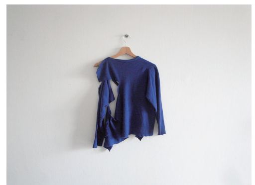
"Let's talk about mother and father." (A sweater that used to unweave and make threads) | 2018 Mixed media | installation, dimensions variable, performance