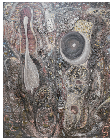
Caress big seeds | 2022 | Oil on canvas 162.2x130.5cm