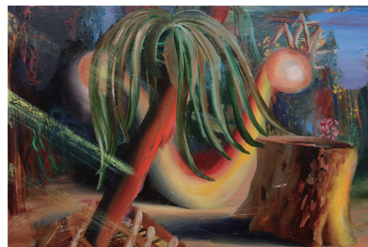
Untitled (Body, Landscape, Fruits) | 2016 | Oil on canvas 60.6x91cm