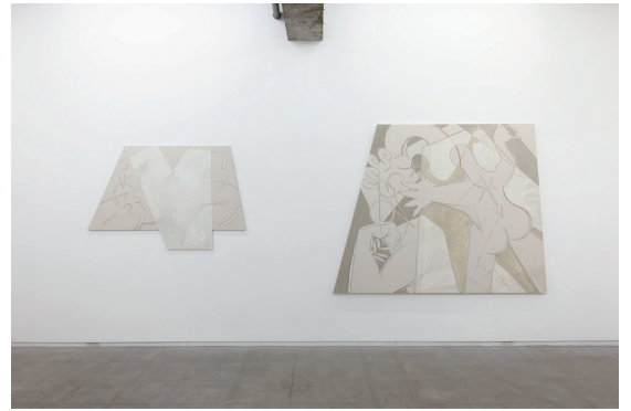
"stick" Installation view at Talion Gallery (Tokyo) 2022 | Photo : Keizo Kioku

2019 "Art Osaka 2019" (Osaka) 2018 "Art Osaka 2018" (Osaka) "VOCA 2018" The Ueno Royal Art Museum (Tokyo) 2015 "Anti Laplace's Demon" TALION GALLERY (Tokyo) "Two Artists Show by Fumiaki Akahane and Keisuke Koizumi" TS4312 (Tokyo) 2014 "Unknown Nature" Waseda Scott Hall Gallery (Tokyo) 2013 "Module Village" JIKKA (Tokyo) 2012 "COVERED TOKYO: October 2012" Chateau Koganei 2F (Tokyo) "National Holiday" TALION GALLERY (Tokyo) 2010 "Secret Sequence" AMP café (Tokyo) 2009 "Truth –Art in the Poor Age-" hiromiyoshii (Tokyo)