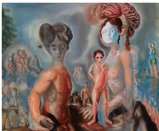
Open-air bath (Hot Springs and Horror) | 2021 | Oil on canvas 53x65.2cm | Photo Ken Kato

2021 "#1" second 2. (Tokyo) 2020 "αM+ vol.1 The National Museum of Art, Okutama (MOAO)"The National Mizuumi of Art, Okutama"-Supporting each other. OKU TAMA coin-" gallery αM (Tokyo) 2017 "VOCA2017 The Vision of Contemporary Art" The Ueno Royal Museum (Tokyo) "Arts in Bunkacho" Agency for Cultural Affairs, Government of Japan (Tokyo) 2015 "Musashino Art University x ISETAN U-35 Art and Design Today by Young Creators" ISETAN Shinjuku 7F (Tokyo) 2014 "The National Museum of Art, Okutama" MOAO (Tokyo) "Group Exhibition by Takahiro Komuro + Kanta Matsuo + Taku Obata" CLEAR EDITION & GALLERY (Tokyo) "Idemitsu Art Award (SAS) 2014" The National Art Center, Tokyo (Tokyo) 2013-17 "Exhibition: Research Associates and Research Assistants" Musashino Art University Museum (Tokyo) 2013 "Tokyo Wonder Wall 2013" Museum of Contemporary Art Tokyo (Tokyo) "Imago Mundi, promoted by the Luciano Benetton " Fondazione Querini Stampalia (Italy) 2012 "31st Outstanding Rising Artists Exhibition. Presented by Sompo Japan Fine Art Foundation" Sompo Museum (Tokyo) 2011 "Tokyo Wonder Wall 2011" Museum of Contemporary Art Tokyo (Tokyo) "Switchers3x3" iGallery (Tokyo) 2010 "Tokyo Wonder Wall 2010" Museum of Contemporary Art Tokyo (Tokyo) "Idemitsu Art Award (SAS) 2010" Hillside Terrace (Tokyo)