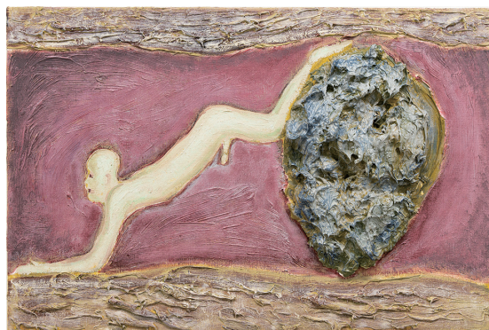
Shit roller | 2022 | Oil on cption | 27.6x40.9cm