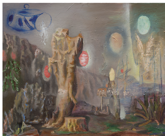
Festival of hot-spring village (Hot Springs and Horror) | 2016-2021 Oil on canvas | 53x65.2cm