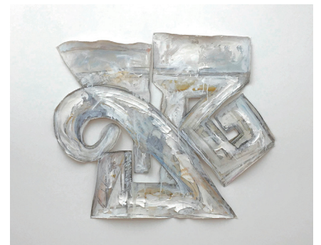
Heading | 2015 | Graphite crayon, medium, wood, paper, cotton | 76.5x60.5cm