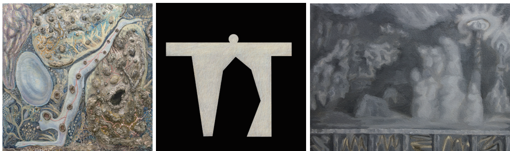
[Left] Fumiaki Akahane | Soil Eater | 2021 | Oil on cotton | 194.5x194.5cm | ©Fumiaki Akahane, Photo Takaaki Akaishi, Courtesy of CAVE-AYUMIGALLERY [Center] Keisuke Koizumi | Livers#168 | 2022 | Digital data [Right] Kanta Matsuo | Dream of stage device | 2022 | Oil on paper | 22.9x31cm

This exhibition focuses on the fact that the front and the back of both human bodies and paintings can be distinguished, which is one of the factors that both assemblages of materials can be regarded as more valuable than mere materials. The front-back markers of the human body can be traced back to the development of the mouth and anus in biological history and it connects to the metabolic mechanism including the digestive system, in other words, the fact that the human is a single tube. Painting can also be a tube, insofar as it has a front and a back. The paintings, as membranes or tunnels in which the facts of life are projected, approach the question of realism: why does a finite world exist without limit?, in a reality that they decay with time as same as like the human bodies.