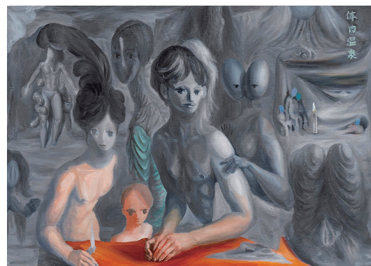
Untitled | 2019 | Oil on canvas | 51.5x72.8cm