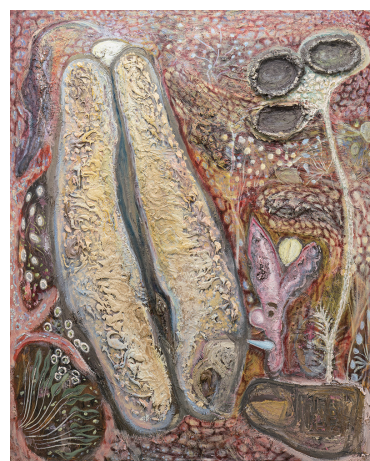
Caress big seeds | 2022 | Oil on canvas 162.2x130.5cm