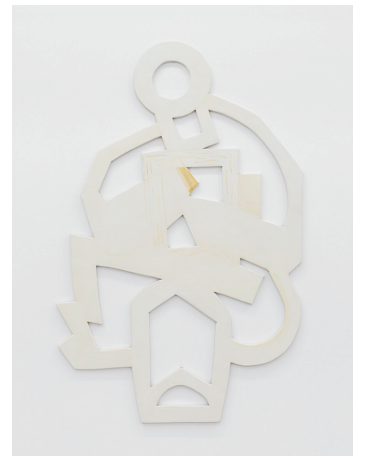
Facing Each Other | 2015 | Oil, medium, glue, varnish, wood, cotton, nail | 142.5x95cm