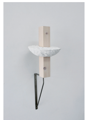
Bowl | 2013 | Plaster, paper 40x17.1x17.3cm